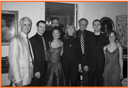
iPalpiti artists and hosts at the February 7 event.