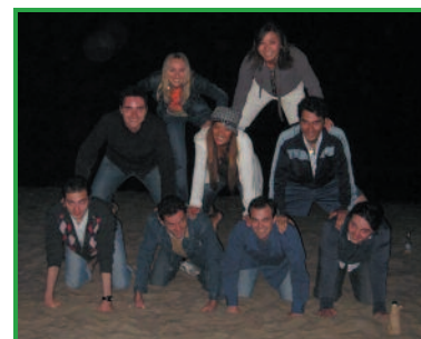
iPalpiti pyramid (the beach)