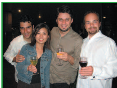
iPalpiti cellos (without!)