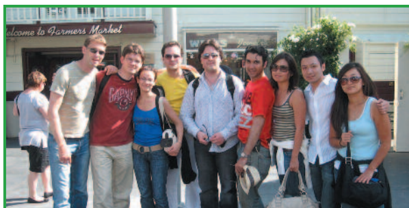
iPalpiti shopping at the Grove