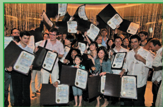
iPalpiti shows off City Proclamations